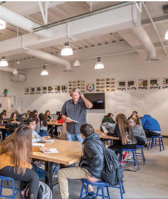
20 NEW CLASSROOMS CANYON VIEW HIGH SCHOOL