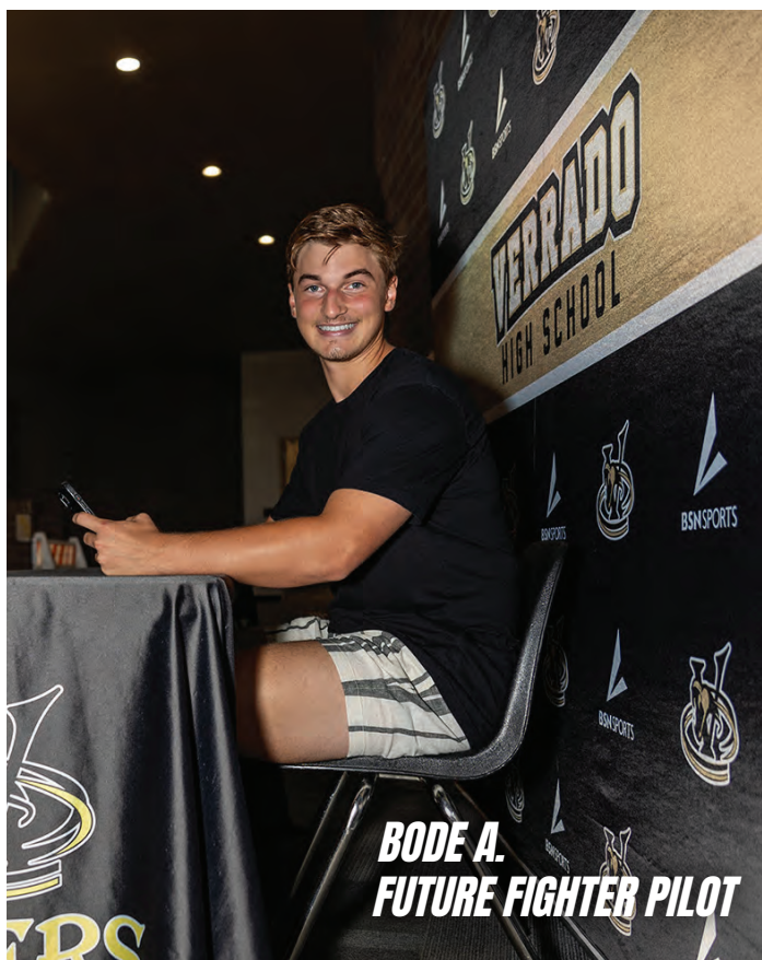
BODE A. FUTURE FIGHTER PILOT