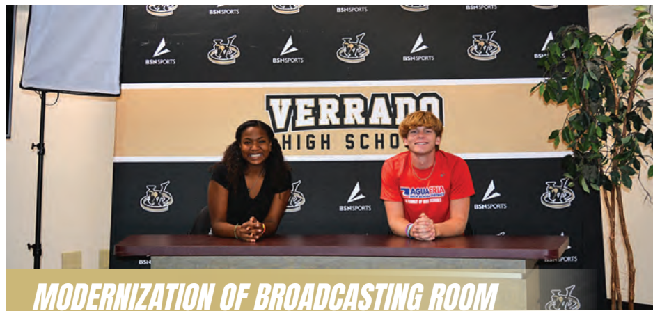
MODERNIZATION OF BROADCASTING ROOM VERRADO HIGH SCHOOL