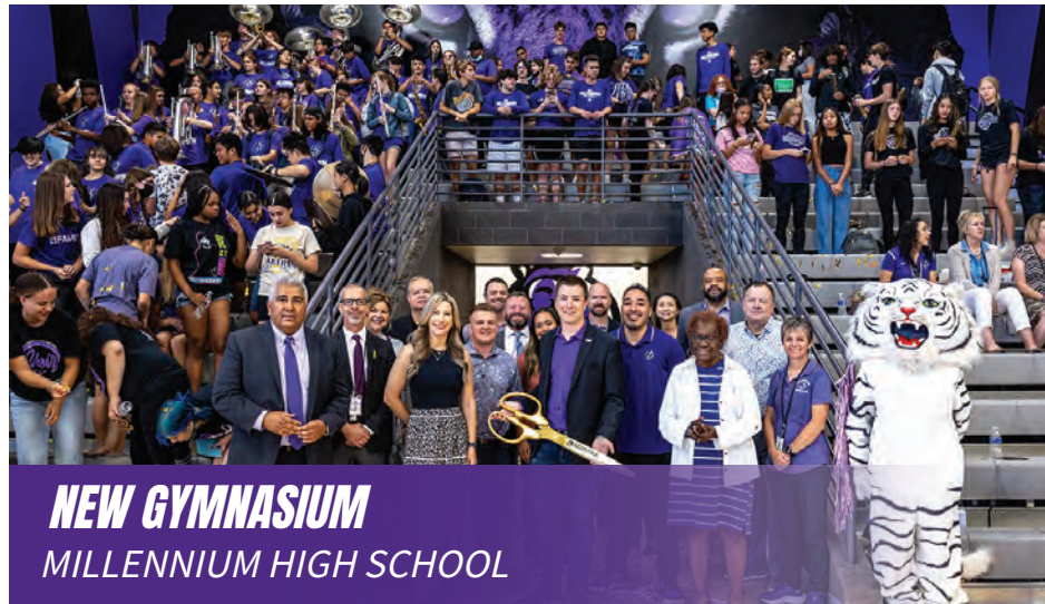
NEW GYMNASIUM MILLENNIUM HIGH SCHOOL