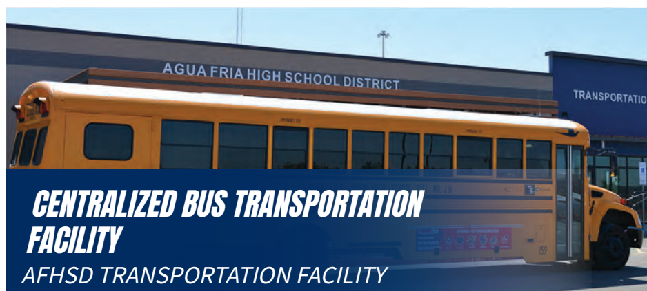
CENTRALIZED BUS TRANSPORTATION FACILITY AFHSD TRANSPORTATION FACILITY