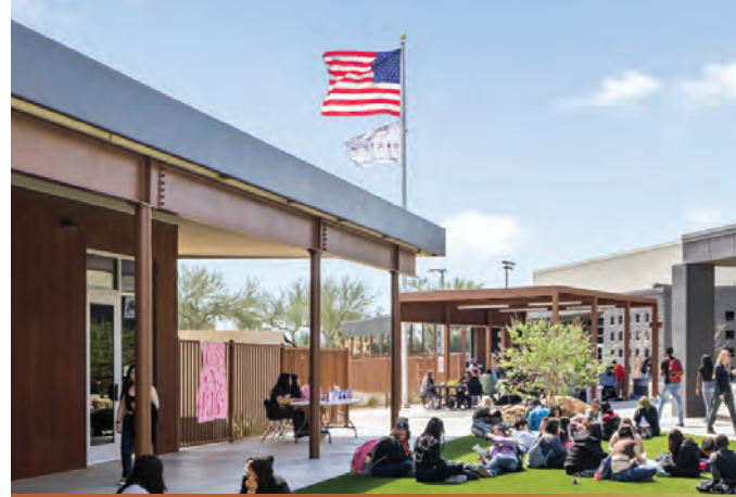
OUTDOOR LEARNING SPACE DESERT EDGE HIGH SCHOOL